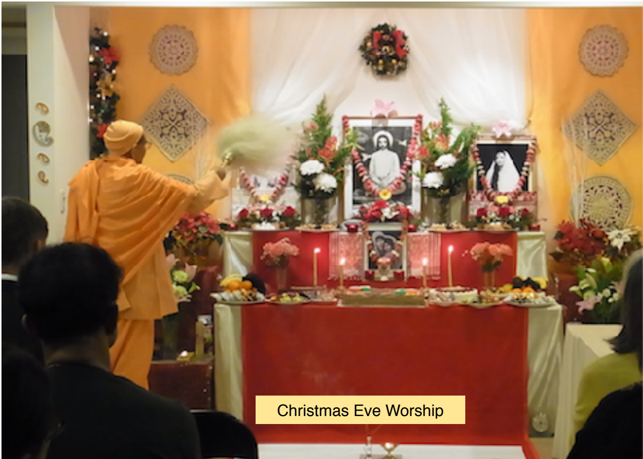
Christmas Eve 2017 (from page 4)

the English verses and the congregation joining in Japanese verses.