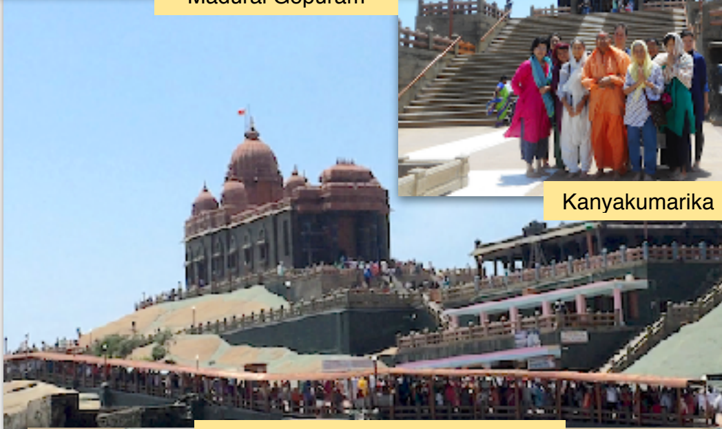
Temple to Goddess Kanyakumarika