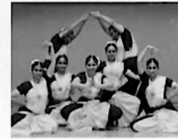
The Mayuka's Indian Classical Dance group ザ・マユカズ・インディア ン・クラシカル・ダンス・ グループ

Exhibition: Books on Hinduism, Meditation, Ramakrishna-Vivekananda in Japanese and English; CDs of devotional songs; Photos; Incense sticks.