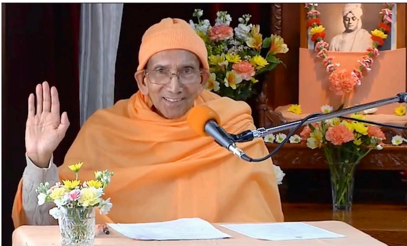
Swami Vivekananda (from page 1)

births and childhoods of Lord Buddha, Jesus Christ and Sri Ramakrishna are not so much like that. One wonders, if Lord Buddha, Jesus Christ and Sri Ramakrishna are incarnations of God, Himself, why was there not much evidence of their divinity during their childhoods like ordinary children born in similar circumstances with few exceptions. Hence, while there are some differences from that of ordinary children, they are not so recognisable as incarnations of God. Only after they matured did it become revealed how extremely different their lives were from those of ordinary people.