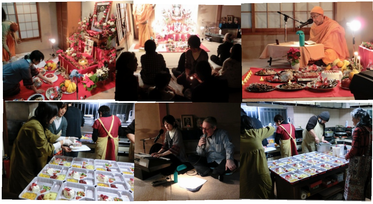
The Vedanta Kyokai Newsletter - December 2013 Volume 11 Number 12