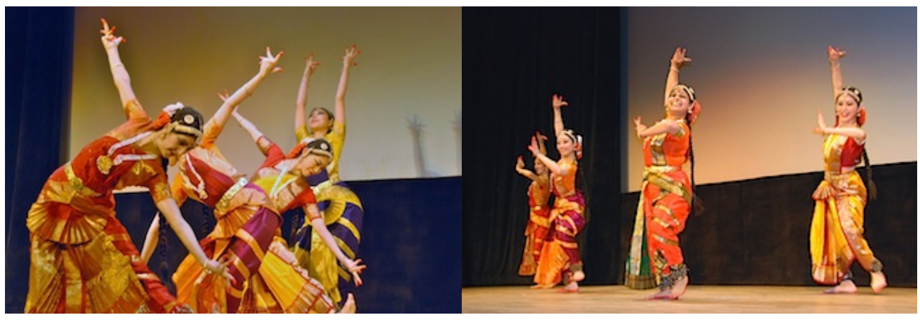
The Vedanta Kyokai Newsletter - December 2013 Volume 11 Number 12